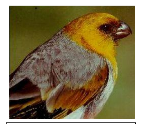
Figure 1. Palila – an endangered finch-billed species of Hawaiian honeycreeper.

Background: The palila ( Loxioides bailleaui ), a finch-billed species of Hawaiian honeycreeper (Figure 1), is protected by federal law under the Endangered Species Act. On Mauna Kea, a large volcano with an elevation of greater than 13,000 feet on the Island of Hawaii, critical habitat for this species has been designated by the U.S. Fish and Wildlife Service to help stabilize the palila population. The palila has a close ecological relationship with mamane ( Sophora crysophylla ), a small stature tree, which it requires for habitat, including food. Fire is a primary threat to the mamane ecosystem due in part to invasive grasses that have produced a continuous fuelbed in the understory that did not exist historically. The Mauna Kea Fire Management Plan represents an interagency effort to develop a comprehensive approach to protect palila critical habitat from wildfires and address general wildfire issues on Mauna Kea. Groups involved in the planning process included