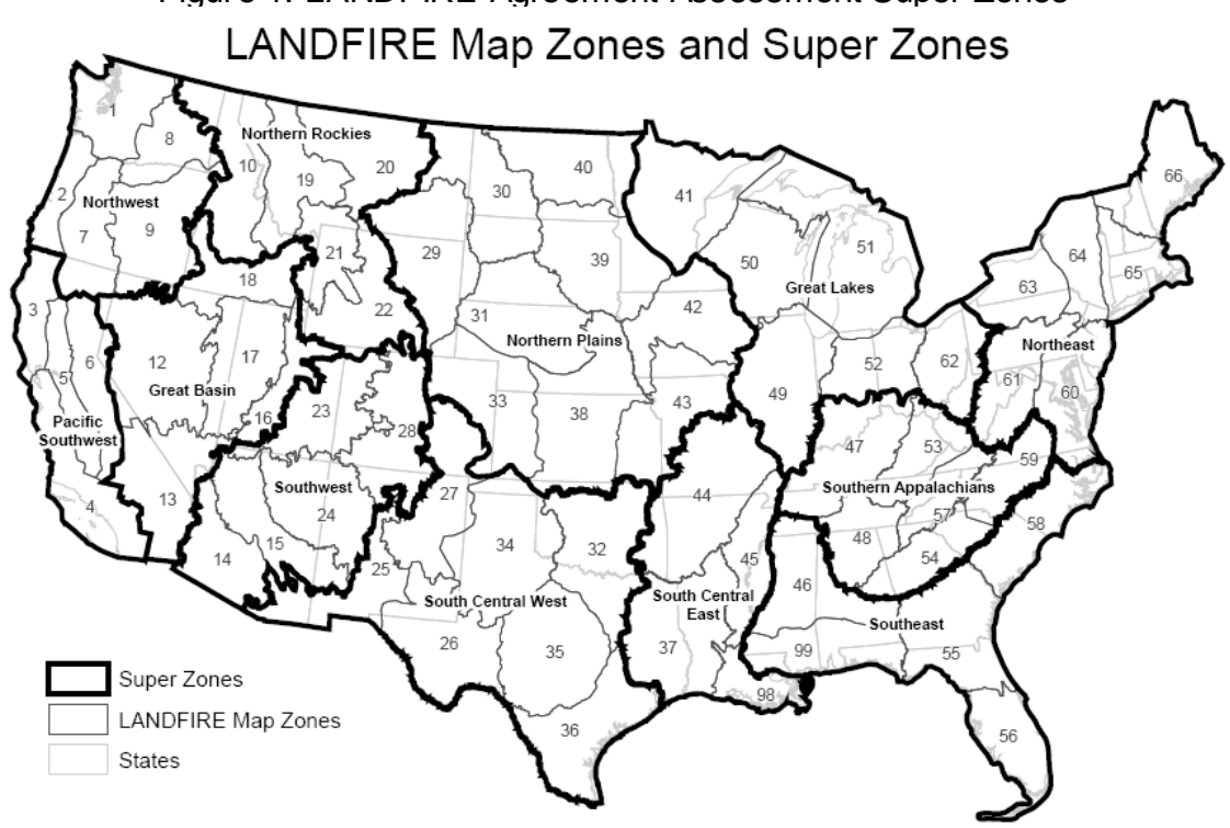
Figure 1: LANDFIRE Agreement Assessment Super Zones

Even with the tens of thousands of plots that comprise the LFRDB, the geographic distribution and number of plots available in the 2% holdout sample presented problems (see "PQCA Plan" on this webpage for more detail on the sample design). Some map zones had few plots (even though the holdout sample was a systematic geographic design), and within every individual map zone the less commonly occurring map classes had no holdout sample plots selected. Because the sample size of holdout plots was not adequate to support precise estimates of agreement at the map zone level, map zones were aggregated into geographic groups known as Super Zones (Figure 1).